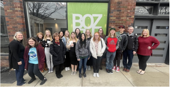
Henry Doorly Zoo